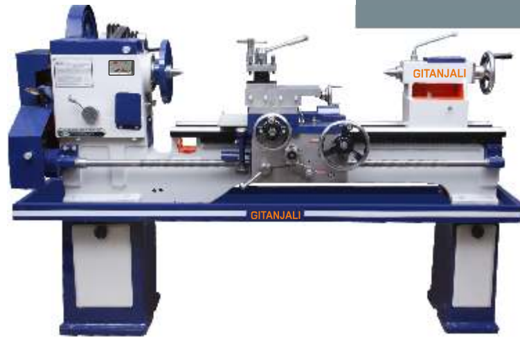
Medium Duty Lathe Machine